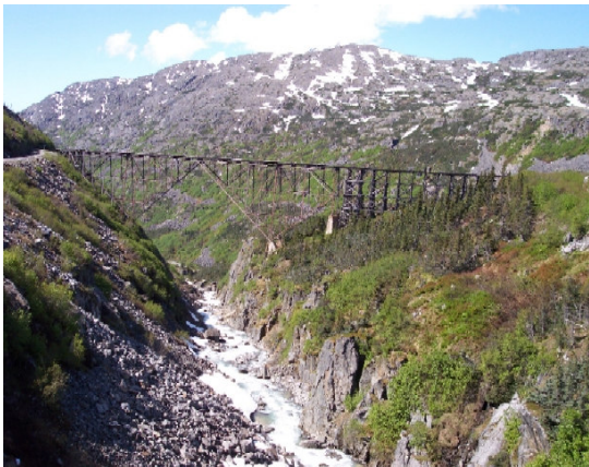
Steel cantilever bridge on WP & YR

Even with the lighter construction of 3 foot gauge the railroad became designated a Historic Civil Engineering Landmark, an honor shared with only 36 other sites in the world (including the Eiffel Tower, the Statue of Liberty and the Panama Canal). Construction workers battled temperatures as low as 60 below zero but managed to complete the line. In 1901 the railroad constructed the tallest cantilever bridge in the world which was used until 1969. In that year a new 675 foot tunnel allowed a line relocation and the bridge was abandoned. It is still visible from the right of way.