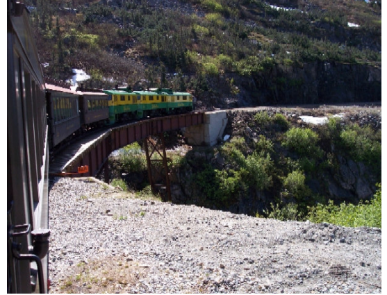
Three green and yellow diesels pulled our Wooden open vestibule passenger cars.

The rolling stock consists of 20 diesels and two steam locomotives now used largely for display. The diesels are GE's from the 1950's and Alco's from the 1960's. They are basically road switchers which have been covered with shrouds to allow the crew to remain indoors while working on the engines. The most unique part of the rolling stock are 69 passenger coaches who average 49 years old. These are wood coaches with open vestibule platforms at either end but they have been rebuilt with large windows to allow enjoyment of the magnificent scenery.