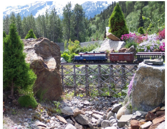
LGB WP&Y diesel pulls box car and Passenger coaches over a short trestle

Of course no trip would be complete without a garden railroad. At Gary Martin's recommendation we visited Jewell Gardens in Skagway. This is basically a landscape nursery focusing largely on flowers and edible plants. It is very attractively laid out and features a garden railway based on (what else) the White Pass and Yukon. The railroad was originally a long figure eight that could also be run as two separate loops. When we visited, one of the loops had been broken to provide a substantial expansion featuring a long curved trestle and several bridges including two from Phoenix's Eagle Iron Works.