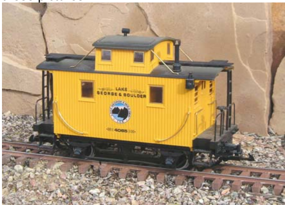
This is the LGB caboose as it came.

Some time ago we published an article on converting the Bachmann 4 wheel "bobber" caboose to a short eight wheel caboose. Glenn Mitchell recently completed a similar conversion of an LGB 4 wheel caboose and sent along these pictures: