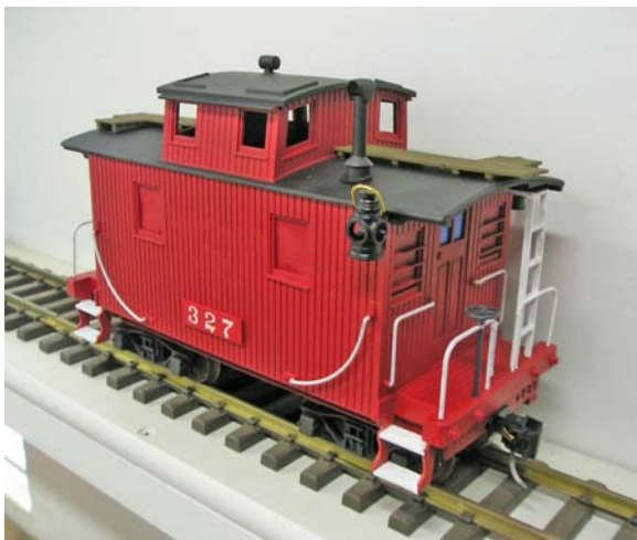
Here is the converted and repainted caboose before weathering.

Even without weathering the repainted and retrucked caboose looks much less toy like. In this picture Glenn hadn't yet removed all of the masking protecting the window glazing nor had he painted the window trim.