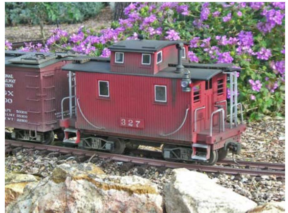
Final product in service on Glenn's railroad.

Even without weathering the repainted and retrucked caboose looks much less toy like. In this picture Glenn hadn't yet removed all of the masking protecting the window glazing nor had he painted the window trim.