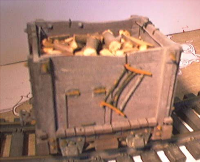
Hartford Disconnect Firewood Car

The Tucson Garden Railway Society is a non-profit corporation incorporated in Pima County, Arizona. Society members are interested in all areas of garden and modular large scale model railroading. We welcome new members and hope you will consider joining. Members help each other build layouts and learn about railroading and modeling.