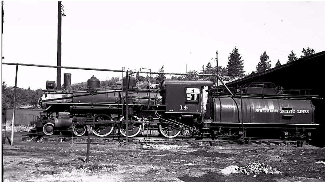
Where does he think he's going? (Note, the lack of track at the left)