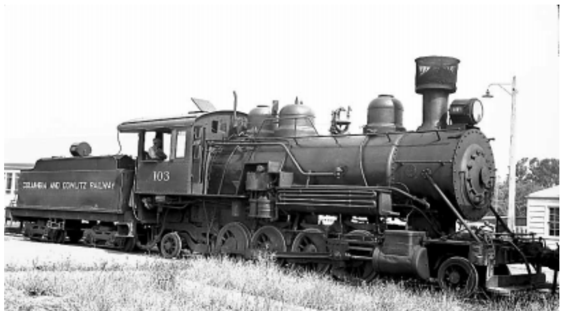
Colombia and Cowlitz Railway Mikado No. 103

Everyone can learn to build stuff so join the contest and learn to build railroad stuff for the Modules or your road at home.